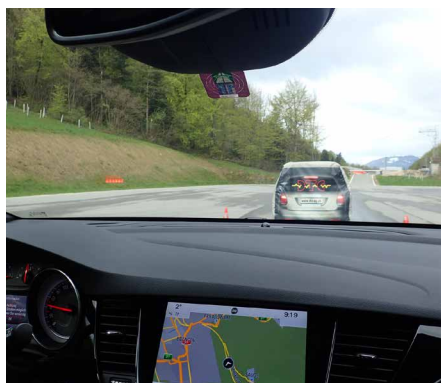
AEBS (Emergency brake assist)

In the „Driving Dynamics“ area, you will experience acceleration, braking and rapid cornering, while in the „Safety“ area you will experience the interaction of your driver assistance systems. On our extra-long sliding surface you will perform driving maneuvers even with low grip in order to keep control of your vehicle in slippery moments.