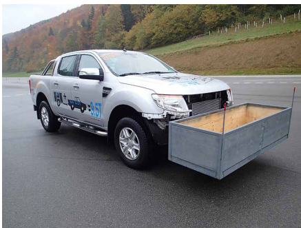
Verification of modifications updated payload

Where existing vehicles are being modified, we are able to test the relevant components and issue the documents necessary for approval.