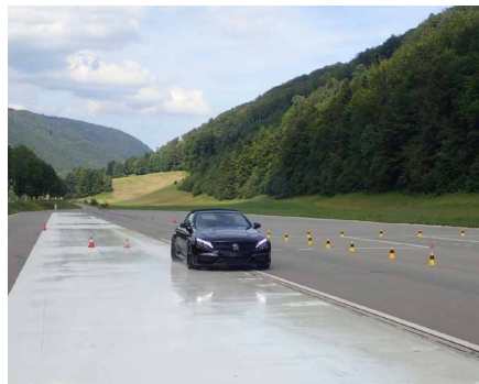
Analysis \mu -split braking