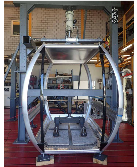
Endurance testing of a cable car

Customer product developments are tested in accordance with current standards or special requirements. Our state-of-the-art test facilities guarantee maximum precision and the highest quality.