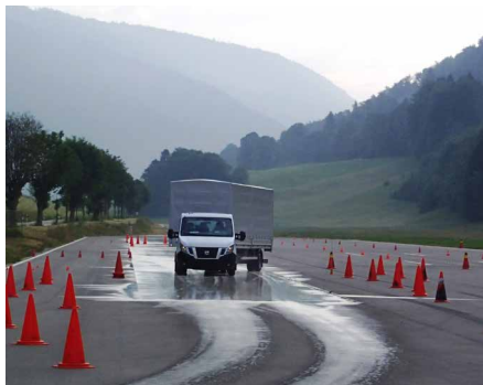
Brake / evasion ESC inspections